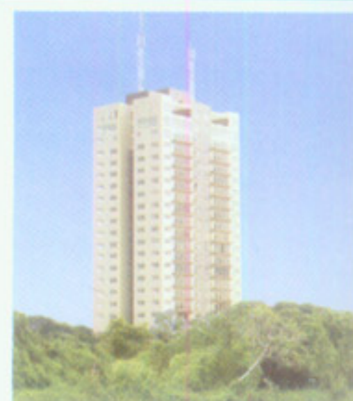
Fairway Residencies [Phase 2]

FORMDEX UNIFLEX A two-component cementitious waterproofing membrane which is an effective, permanent waterproofing solution for all masonry structures.