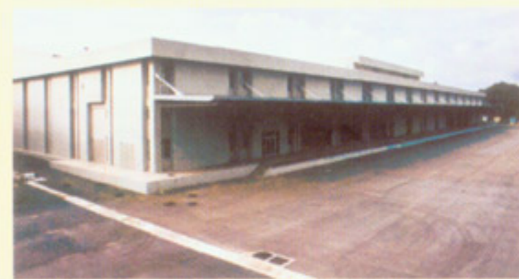
New Cargo building, BIA, Katunayake

TekniFloor SLS10 is a high bond strength, crack-free, fast-setting and hardening self-levelling polymer-modified cementitious underlay for floor coverings such as carpet, ceramic floor tiles, parquet, vinyl, etc., which require a smooth, flat surface. Easy, single-layer application.