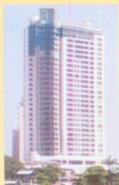
Conmix C500 used in Monarch Tower (apartment building)

More and more people nowadays are using ceramic tiles in construction. Naturally the range of products available is always increasing. At the same time, there is an ever-expanding choice of demanding backgrounds, so it follows that the newer types of tiles (both floor and wall tiles) have a much more challenging performance-criteria. To mention a few ... external cladding, swimming pools, floors or walls subject to movement, tile on tile, tile on wood, etc.,