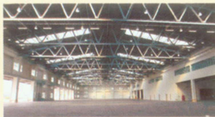
New Cargo building, BIA, Katunayake

A non-metallic floor hardener used to form monolithically hardened concrete floors, TekniFloor Plus provides a hardened, heavy-duty, abrasion-resistant surface which can withstand heavy loads and traffic, inhibits the formation of dust and is ideal for all demanding floor surfaces.