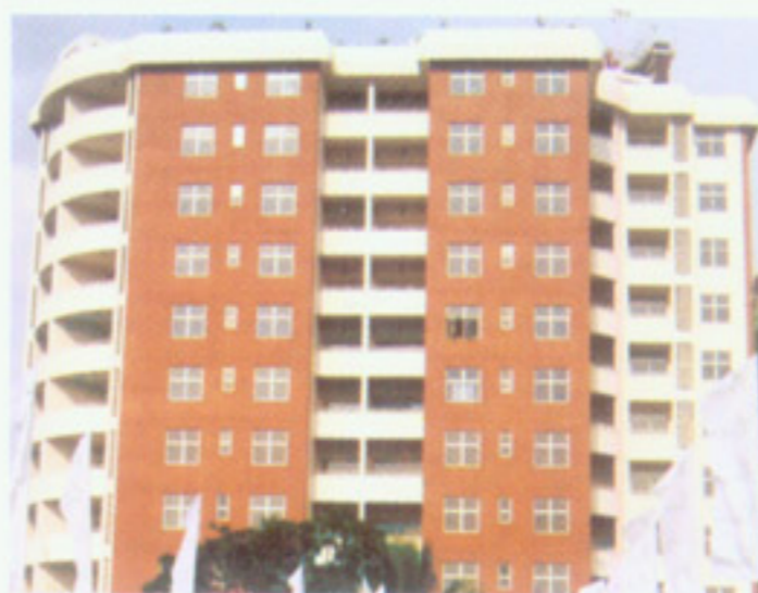
Trillium Residencies [Phase 1]

Elegance tile is a water-based high build acrylic resin-textured body coat incorporating natural ceramic chips, which creates a tile-like finish by the use of special pattern-papers.