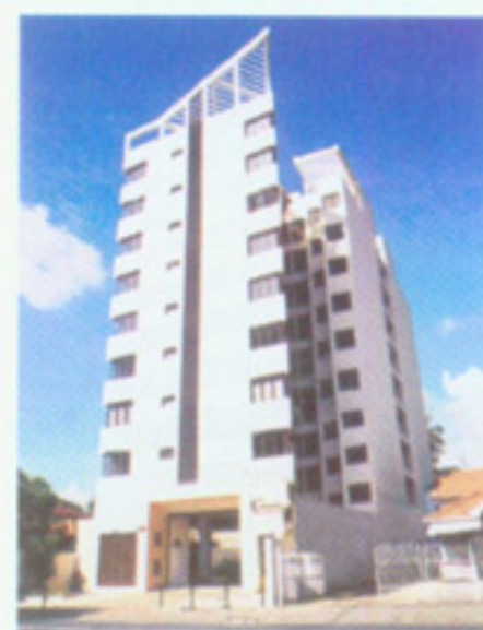
6th Avenue Apartments