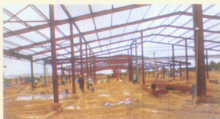
David Pieris Motor Company project at Ranna

A cement-based non-metallic, non-shrink free flow grout that maintains a fluid consistency especially useful over extended working-times. Designed for use in local conditions and for all general and non-critical applications. Ready-to-use.